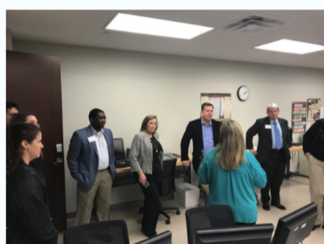
Tour of the Cyber Center at the Anne Arundel Community College (AACC), an NSA recognized Cyber Center of Excellence