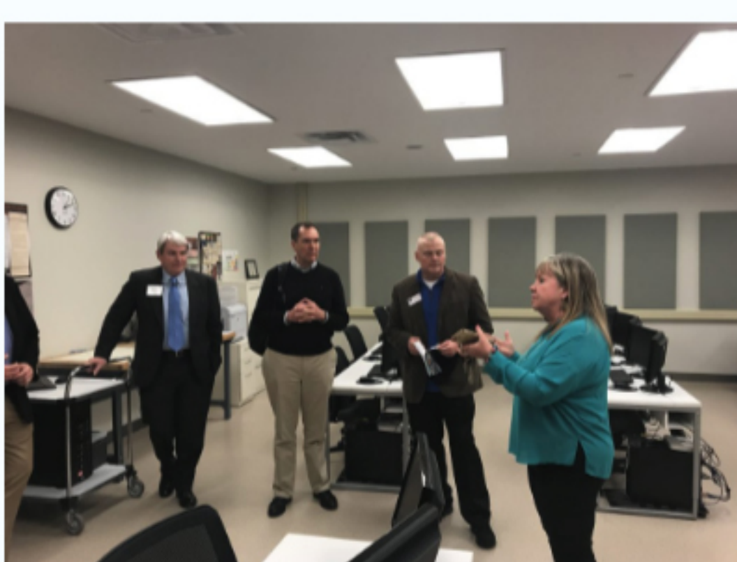
Tour of the Cyber Center at the Anne Arundel Community College (AACC), an NSA recognized Cyber Center of Excellence - pictured here is a mock SCIF space.

Vision Technologies Moves to Hanover, Plans 100 New Jobs in Anne Arundel County »