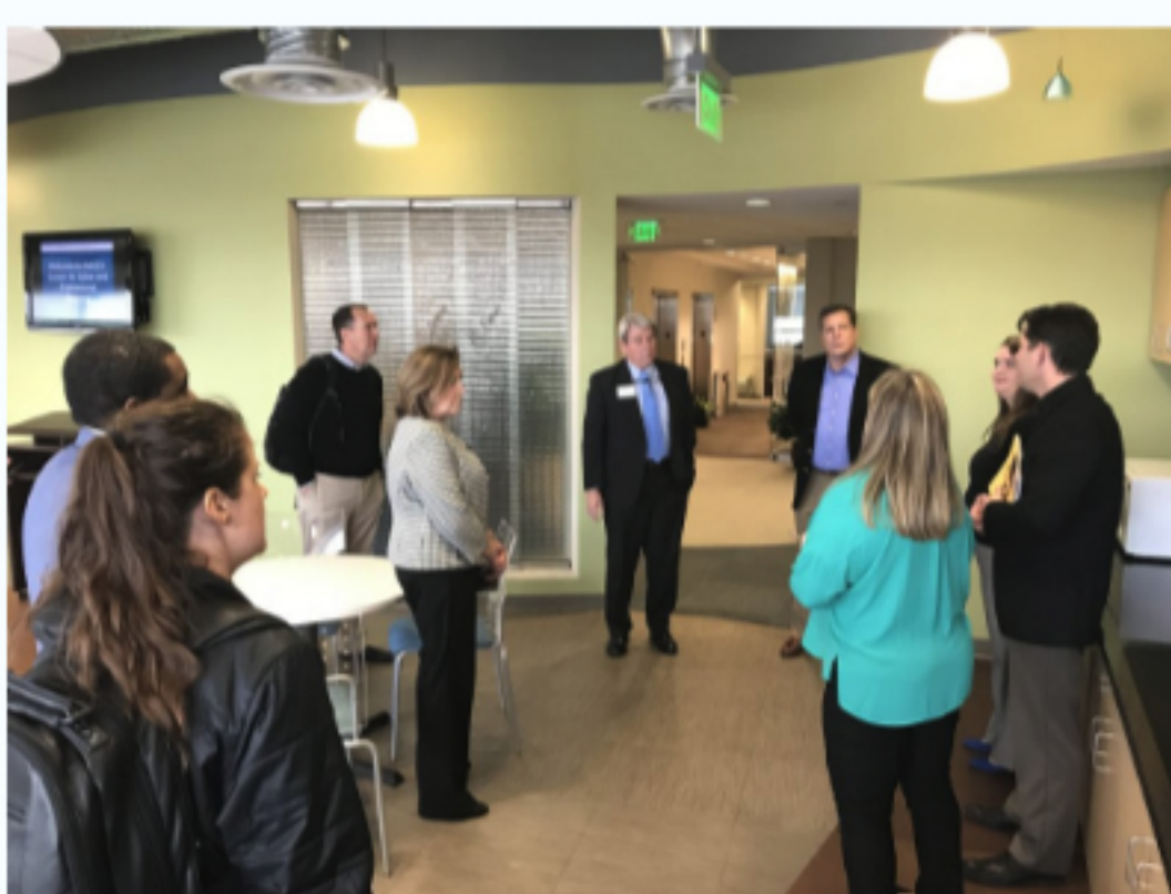
Tour of the Cyber Center at the Anne Arundel Community College (AACC), an NSA recognized Cyber Center of Excellence